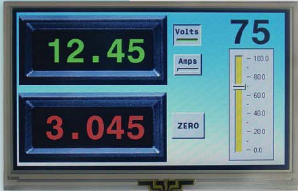
4.3-inch front view