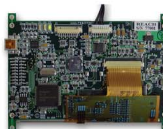
4.3-inch rear view

Call sales at 510-770-1417 or email sales@reachtech.com for more information or to order.